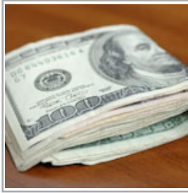
Tricks Car Insurance Agents Don't Want You to Know