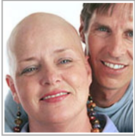
These 5 Signs Warn You That Cancer Is Starting Inside Your Body