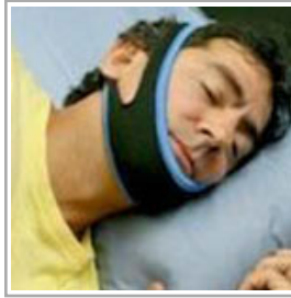
A New Solution That Stops Snoring and Lets You Sleep